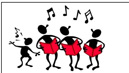
"JUMP START" BARBERSHOP QUARTET